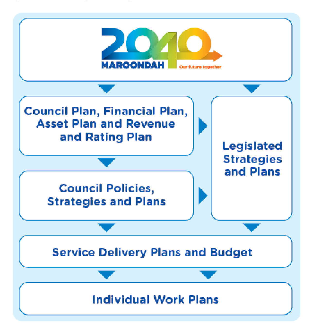
Figure 1: Council's Integrated Planning Framework