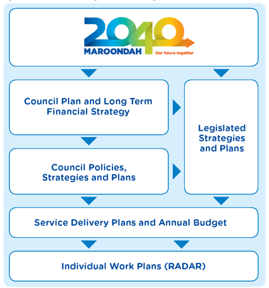
Figure 1: Council's Integrated Planning Framework

The Draft Council Plan 2017-2021 (2018/19 Update) has been prepared in accordance with requirements of the Local Government Act 1989 . The Act requires the Council Plan 2017-2021 to include the strategic objectives of the Council (community outcome areas), strategies for achieving the objectives for at least the next four years (key directions), strategic indicators for monitoring the achievement of these objectives (Council Plan indicators) and a Strategic Resource Plan describing financial and non-financial resources.